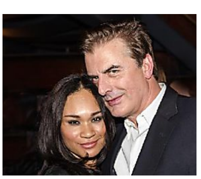
20 Popular White Celebrities Who Have Black Spouses POPHitz

10 Famous Faces of Breast Cancer Lifescript