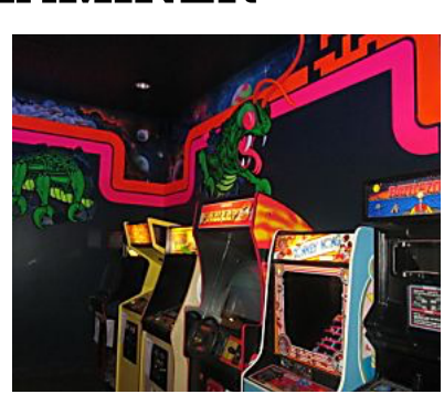
The Grand Opening of the National Videogame Museum in Frisco is here ousting