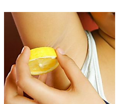
7 Uses For Lemons You Never Knew