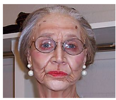
Husband Shocked At Wife's Dramatic Makeover...Wait Until Y... HealthyPanda.net OnlineImproper